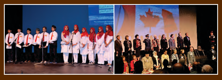
October 13, 2012: Idea of an Ideal Government - Waterloo