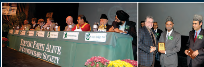
October 16, 2010: Keeping Faith Alive In Contemporary Society