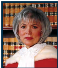
The Right Honourable Beverley McLachlin Chief Justice of the Supreme Court of Canada

“... Endeavors such as the World Religions Conference are vital for they demonstrate to the world that despite the richness of our differences, we have so much in common and can live together in a spirit of understanding and compassion ...”