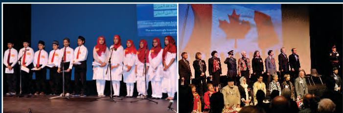
October 13, 2012: Idea of an Ideal Government