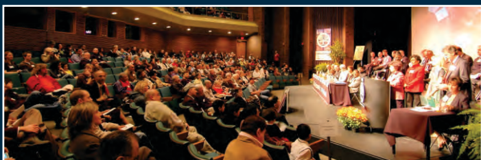
October 24, 2009: Is God Relevant in Today's World