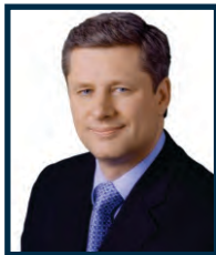
The Right Honourable Stephen Harper Prime Minister of Canada

“... This unique event - the largest multi-faith conference of its kind in Canada - brings together individuals from a wide range of religious beliefs ... The fact that you have been assembling in a spirit of dialogue and congeniality for almost three decades speaks to your commitment to foster mutual understanding, respect and acceptance and thus to make the world a better place ...”