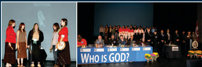
October 1, 2011: Who is God? Nature and Characteristics