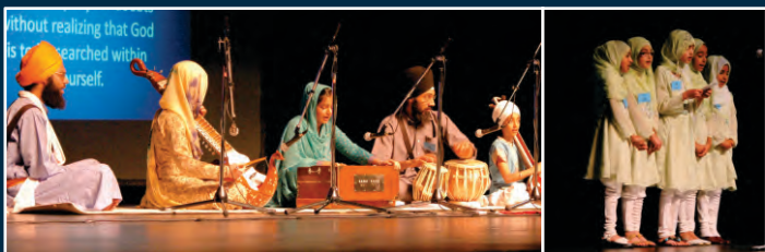
October 26, 2008: Founders of Religion, Model for Humanity