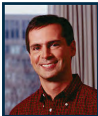
The Honourable Dalton McGuinty Premier of Ontario

“... We believe that mutual respect and a genuine desire for understanding are key to a peaceful world ... The World Religions Conference embodies these very values as it brings together people of beliefs in a spirit of cross-cultural and inter-faith appreciation and acceptance ...”