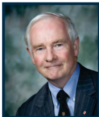
His Excellency the Right Honourable David Johnston Governor General of Canada

“... Canadians have the good fortune of living in an inclusive society, where religious diversity is appreciated and recognized as a great strength. This conference, which brings together people from diverse faiths and backgrounds in a spirit of goodwill and collaboration, serves to address important societal issues and to strengthen our mutual respect. ...”