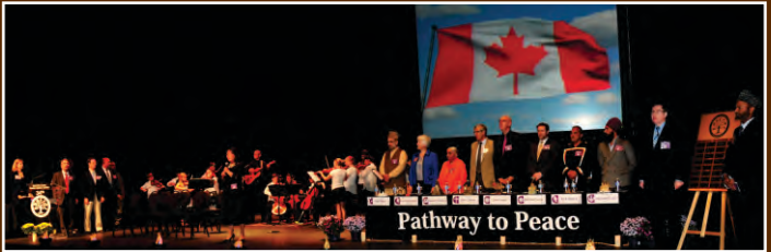
September 24, 2014: Pathway to Peace - Guelph