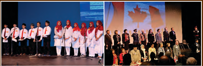
October 13, 2012: Idea of an Ideal Government - Waterloo