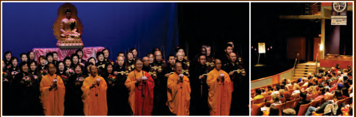
October 6, 2013: Religious Freedom as Practised by Founders - Guelph