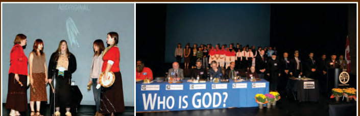
October 1, 2011: Who is God? Nature and Characteristics - Waterloo